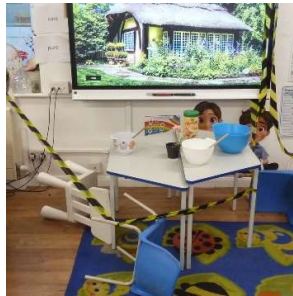
Goldilocks crime scene in Robins!

This half term has been packed with exciting activities in Wrens , Robins and Doves ! In the mornings, each class has continued to focus on English, Maths and Phonics, providing a solid foundation for their learning. The afternoons have been just as engaging, with the children diving into the rest of the curriculum, including Forest School . It's been wonderful to see them grow and develop their skills, both inside the classroom and outdoors. A big well done to all for their hard work throughout the term!