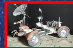
Gustav Holst The Planets Full Suite

Gears & Pulleys (Design Motorized Lunar Rover)