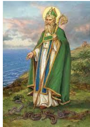
Saint Patrick – the patron saint of Ireland