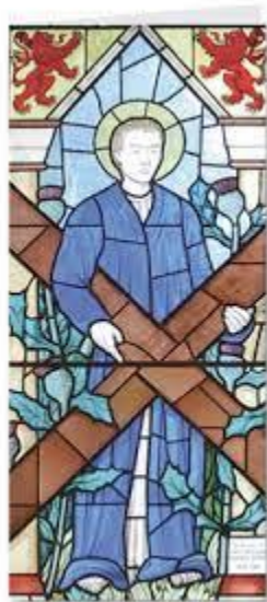
Saint Andrew – the patron saint of Scotland